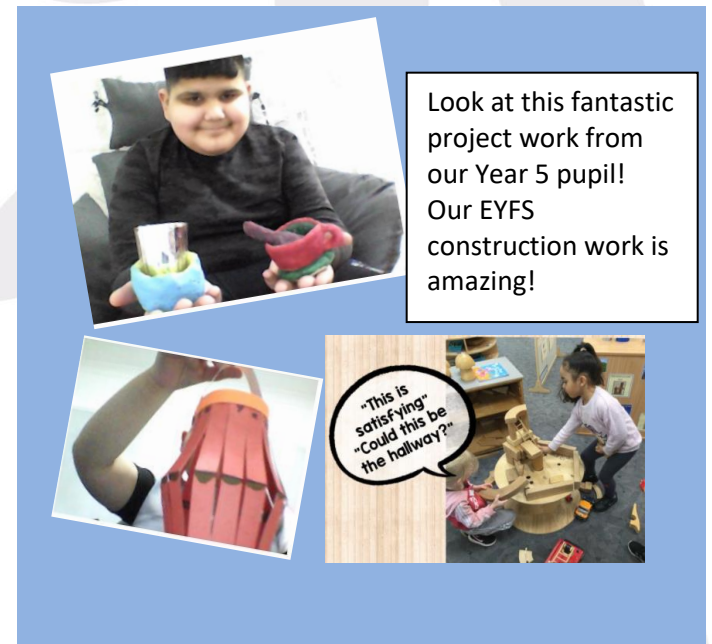
Look at this fantastic project work from our Year 5 pupil! Our EYFS construction work is amazing!