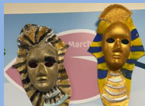
Maple -Egyptian Death Masks

We are so proud of the fantastic work produced by children at Old Bank in the short time back at school.